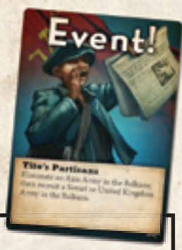
Tito's Partisans Eliminate an Axis Army in the Balkans; then recruit a Soviet or United Kingdom Army in the Balkans.

Some cards specifically direct you to build or recruit a teammate's piece: this is not a misprint! However, unless the card indicates another country, a card always refers to the pieces and cards of its own country.