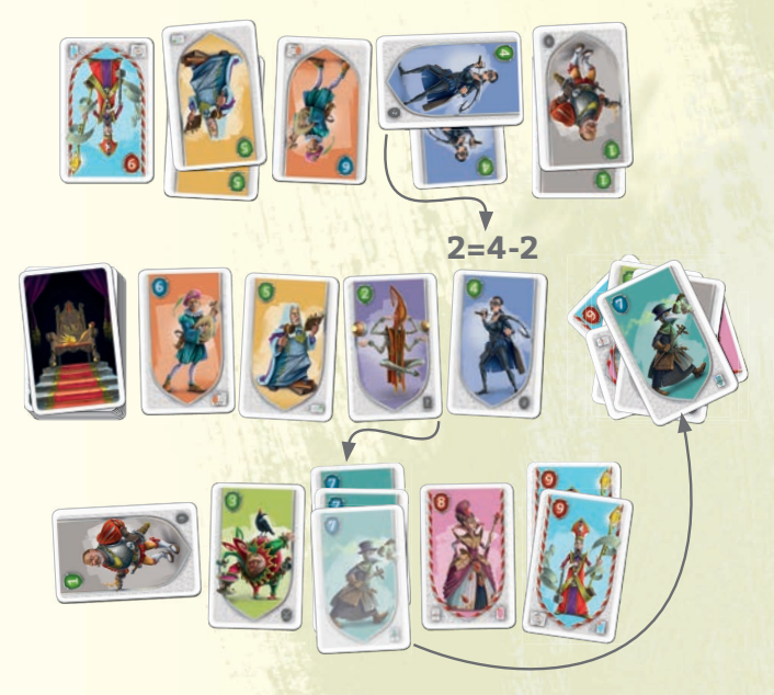
The player uses the Assassin's ability to change the 4 to 2, and destroys the opponent's Alchemist.

Discard destroyed cards to the discard pile.